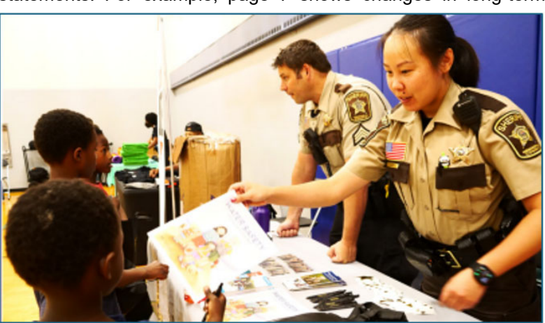
Sheriff's deputies at a community event.

The statements, schedules, and note disclosures that are shown on pages 99 to 159 as Supplementary Information provide additional information for the County's funds, including budgetary information for use in judging compliance with approved budgets. Pages 102-106 show budgetary comparisons for each of the General Fund departments. For example, under the Law, Safety and Justice program, the Sheriff's Office expenditure comparisons are shown.