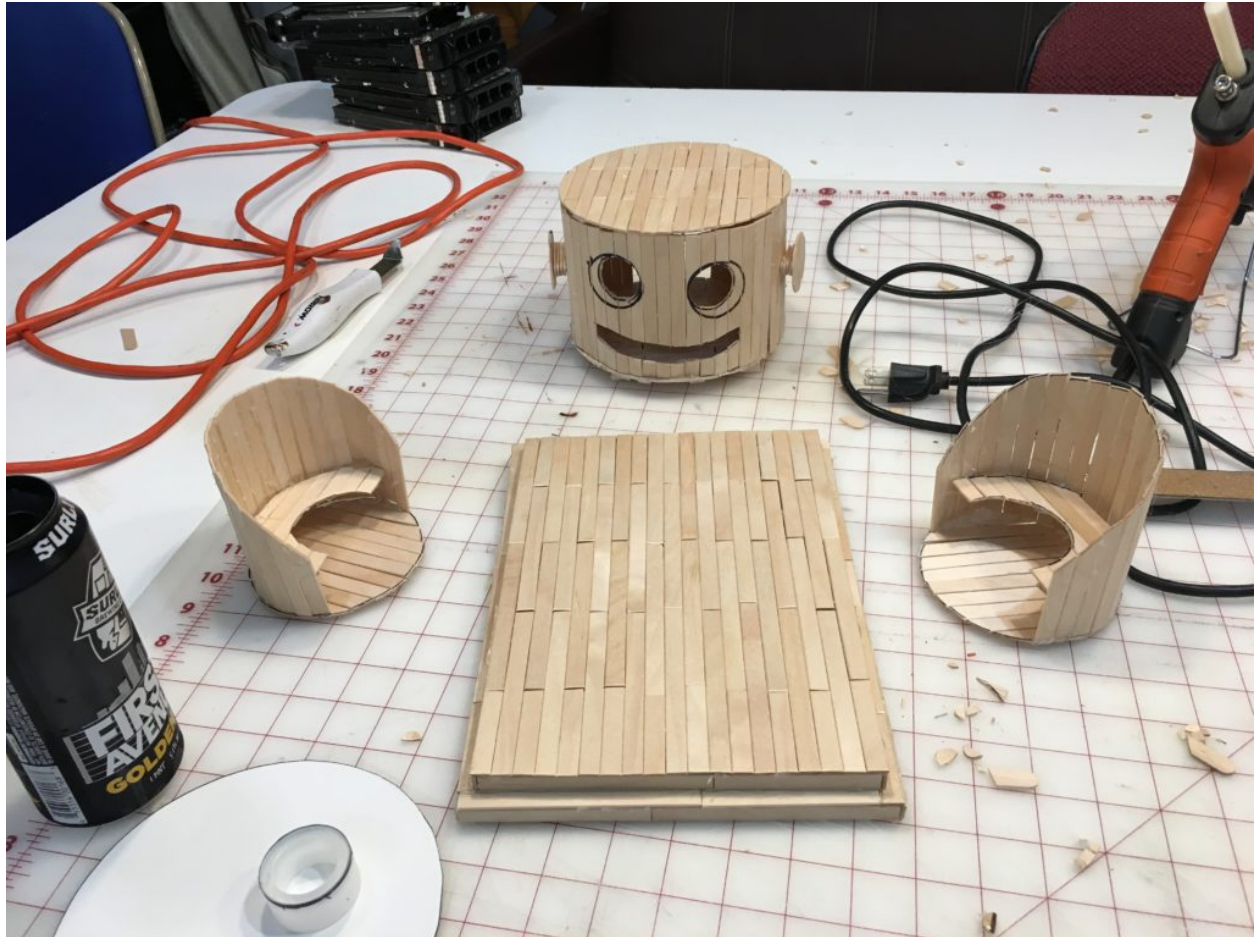
Nick Knutson’s robot project in progress. Photo by the artist.

community, where 20 percent of residents are foreign-born, we are also building relationships with immigrant artists.”